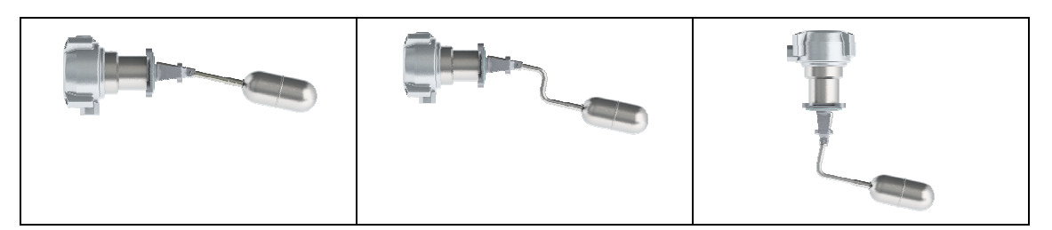
For side mounting, observe the "Top" arrow on the type plate.

During installation, the correct operating position must be observed.