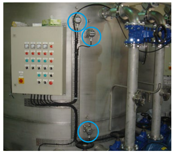
Level switch type: A 01 051E15