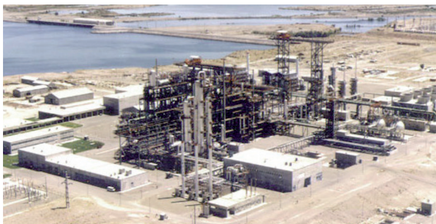
Arroyito Heavy Water Production Plant, Argentina

Bachofen offers standard and industrial type level switches including float chambers for by pass installation for OEMs and plant manufacturers. Additional capacitance switches, float switches, level indicators and transmitters complete our range of convenient, one-stop-shopping products.